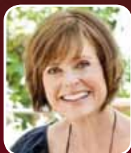
Judy Bailey Broadcaster Nurturing Children and Brain Development